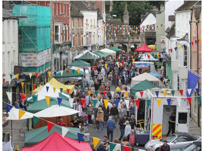
Petticoat Lane map and street scene