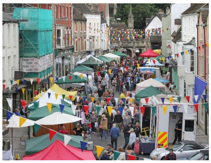
Petticoat Lane map and street scene