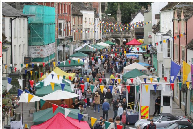
Petticoat Lane map and street scene