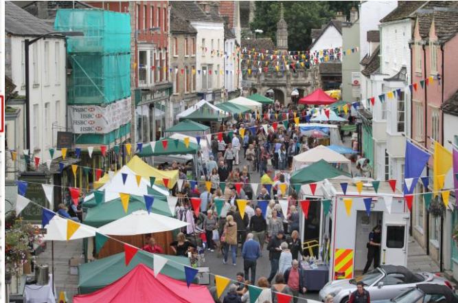
Petticoat Lane map and street scene